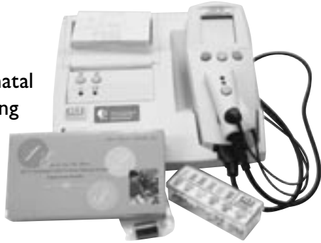
Universal Neo-natal Hearing Screening

(The Child Development Resource Kit) is an effective resource that enhances the department to target speech and language stimulation techniques through play. A wonderful asset to the people (who work with children) who would otherwise not have access to these developmental toys. – Department of Speech and Language Pathology, Stanton Territorial Hospital, Yellowknife