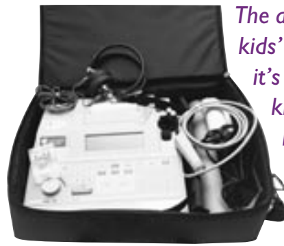
Pure Tone Screening Audiometer Replacement

The audiometer helps us test kids' hearing at younger ages and it's easier to administer to the kids. We also tell teachers we have the machine in case new students have hearing problems. And the Nipissing helps us when kids are delayed in language or speech, we find the problem right away. – Community Health Representative, Deline