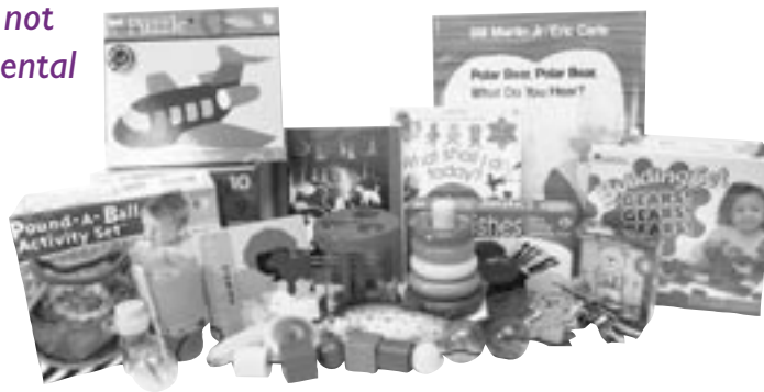
Child Development Resource Kit

(The Child Development Resource Kit) is an effective resource that enhances the department to target speech and language stimulation techniques through play. A wonderful asset to the people (who work with children) who would otherwise not have access to these developmental toys. – Department of Speech and Language Pathology, Stanton Territorial Hospital, Yellowknife